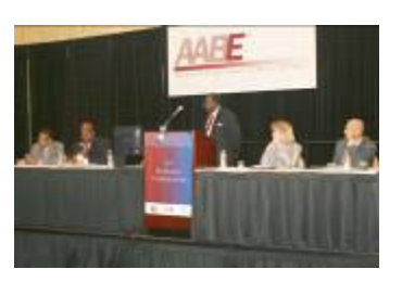
The CEO Roundtable Session at the Conference.

The conference was planned and hosted by the Southwest Region Chapters of AABE. These chapters included Houston, Arkansas, Dallas/Ft. Worth, Louisiana, Central SW Louisiana, Mississippi,