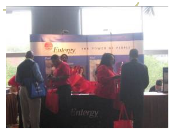
Entergy's booth at the Career Fair during the Conference.

A part of AABE's overall mission is to encourage African-American students to pursue careers in energy-related fields.