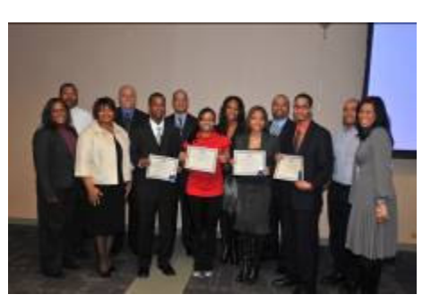
AABE NJ Chapter & Scholarship Winners

I'm glad AABE is able to help you pursue your dreams."