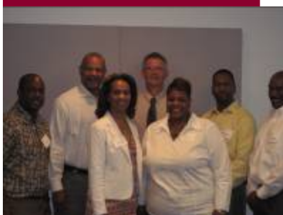
AABE Cincinnati Chapter partners with Boys/Girls Hope