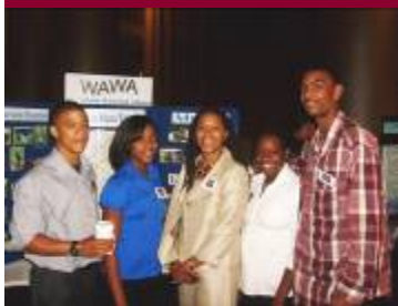
Students attending the NABGG Conference

Chapters involved in planning the 2010 conference include Alaska, California Central Valley, Denver, Northern California, Southern California and Washington-Oregon.