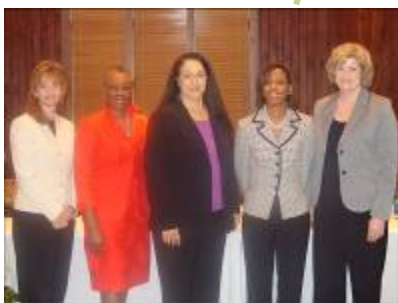
AABE Gulf Coast Chapter's Women in Energy panelists.