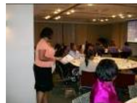
AABE Members at Atlanta Chapter Meeting in Georgia

The Initiative’s goals are to create and maintain additional AABE Student Chapters at HBCUs and other accredited institutions across the country. Volunteers are needed to provide mentoring, part-time & full-time employment opportunities, and track professional development of our AABE scholarship recipients and other Minority students interested in the fields of energy & the environment. Both the organization and the students are expected to benefit from this partnership. To assist in this program, please contact rcleve@aglresources.com . ☀