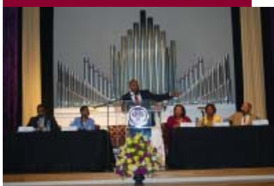
AABE Birmingham Chapter Energy Forum Panelists