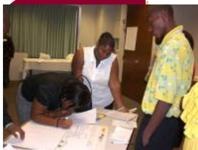
AABE NC Chapter Youth Day Participants