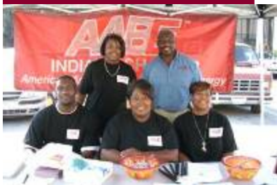
AABE Indiana Chapter energy booth volunteers