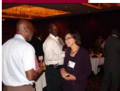
SCCAABE Professional Development Seminar attendees