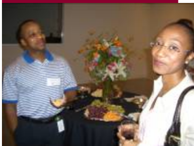
AABE Houston Chapter networking event

In addition to sharing valuable information, organization members offered coloring books for kids, and a drawing for 9 home energy conservation kits including a variety of the following: shower timers, oxygenating showerheads, aerating faucet attachments, energy efficient light bulbs, furnace filter alarms, weather stripping and insulation materials, conservation stickers, etc. All winners were elated to receive their packages. The AABE Indiana Chapter also plans to participate in energy fairs in other areas including Gary, South Bend and Ft. Wayne. ☀