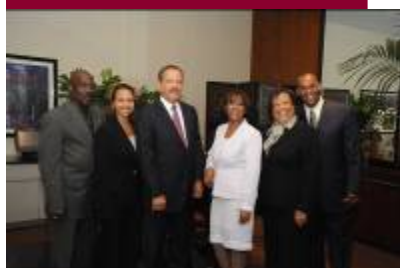
AABE Southern California Chapter Officers