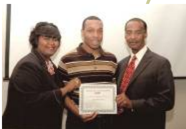
AABE TN Chapter Scholarship Winner